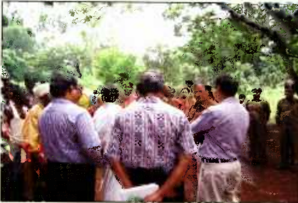
Visit of Forest Secretary to Similipal