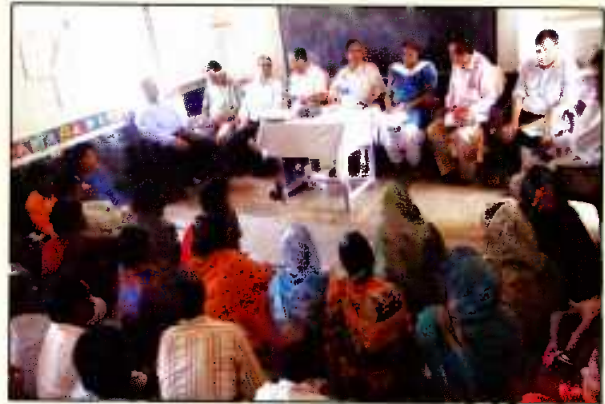
Central Monitoring Committee on relocation, Amdiha