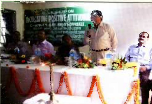
Workshop on Inculcating Positive Attitudinal Changes Amongst Officials