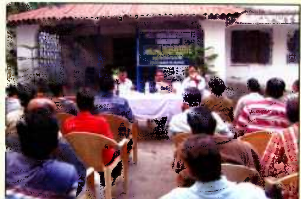
Taxi owners orientation meeting at Baripada