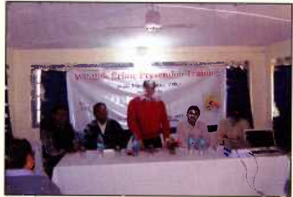
Training on Wildlife Crime at Jashipur