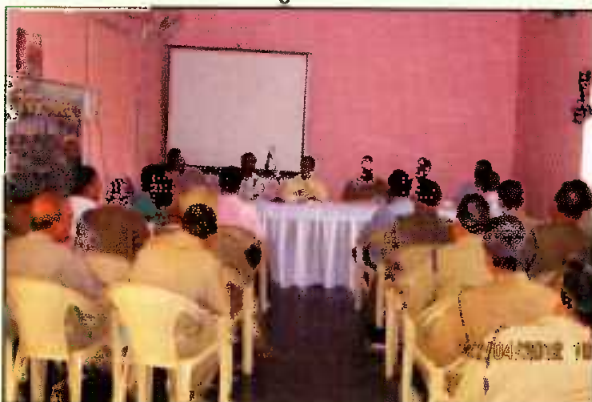
Core-buffer co-ordination meeting