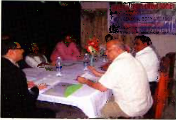
8th General Body meeting of SES