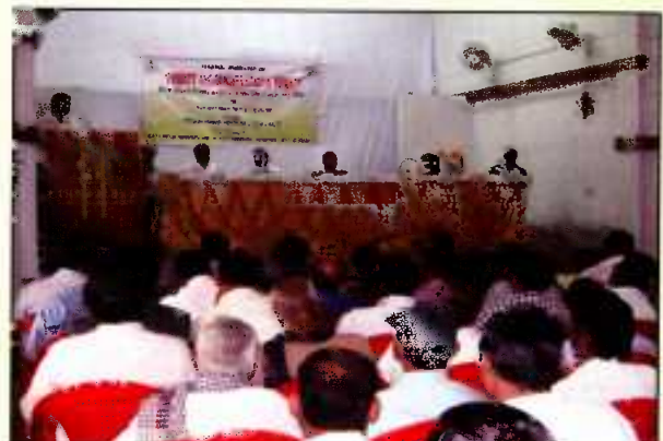
Regional Workshop on Poverty & Conservation of Forest